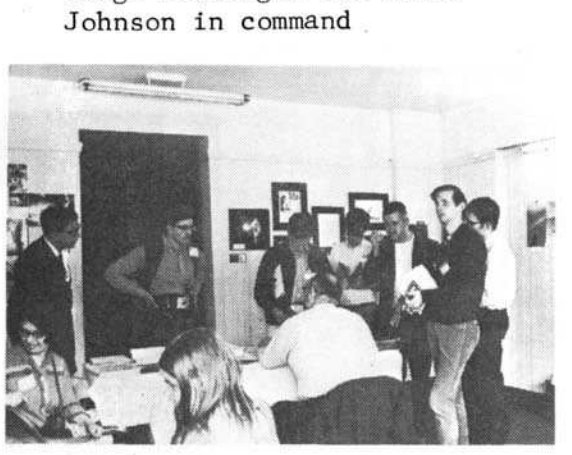
The Art Show room