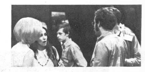
"What? No Corflu?"