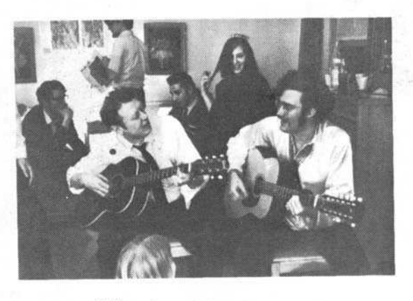
"That's all folks!"